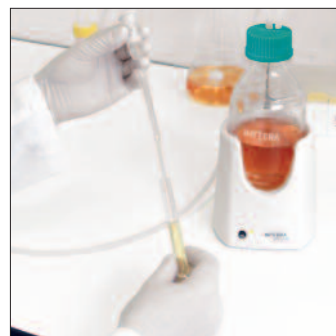
Supernatant removal to harvest bacteria