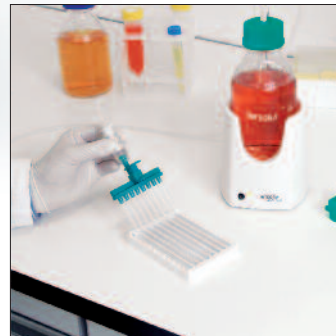
Aspiration from Western blot strips