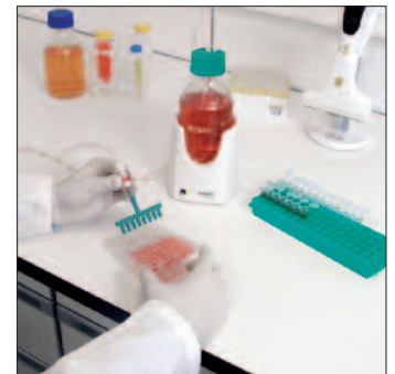
Removal of washing solutions