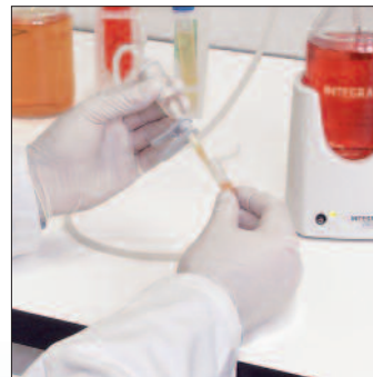
Aspiration of supernatants