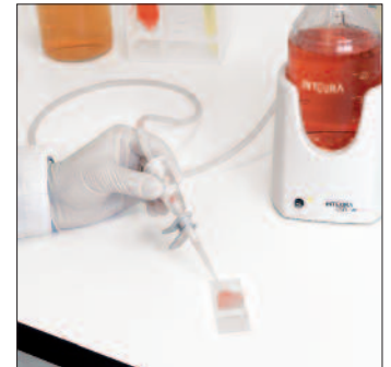
Removal of excess liquid from object slides