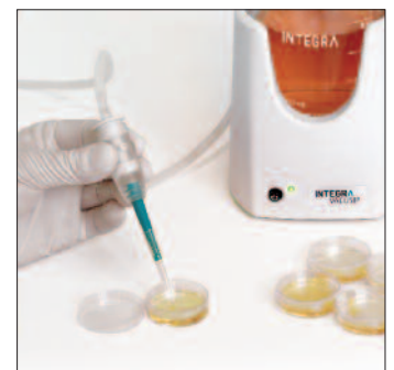
Removal of culture media